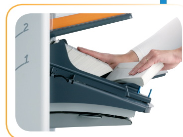
Optional Production Feeder holds up to 325 BREs

Formax - New Hampshire, USA www.formax.com