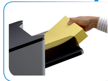
High-capacity Document Feeder holds up to 725 sheets and multi-page sets