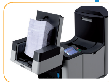
High-capacity Vertical Stacker holds up to 500 filled envelopes