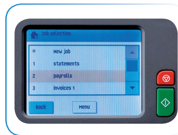
User-friendly full-color touchscreen control panel

* Paper & envelope specifications may vary. All media must be tested.